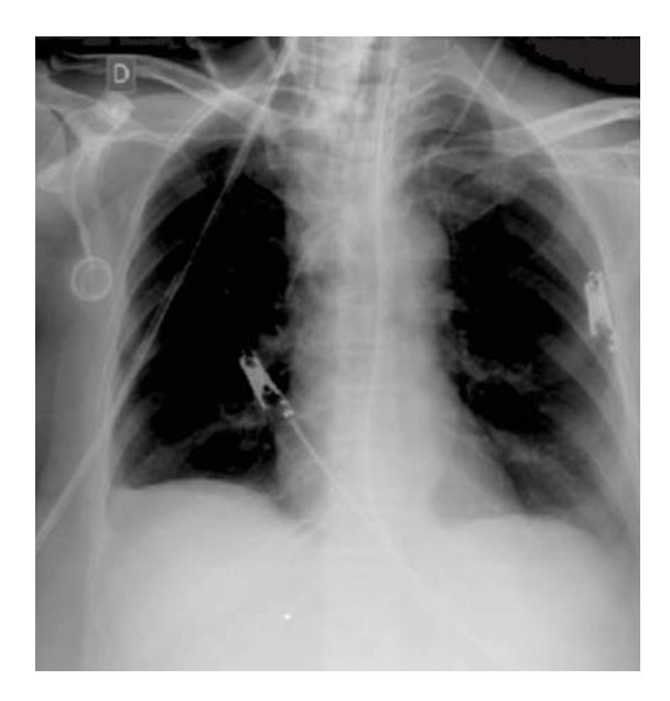
Figure 3. Recent chest radiograph of control showing absence of pleural effusion, and the implanted port for chemotherapy (at the anterior chest region and below the right clavicle).