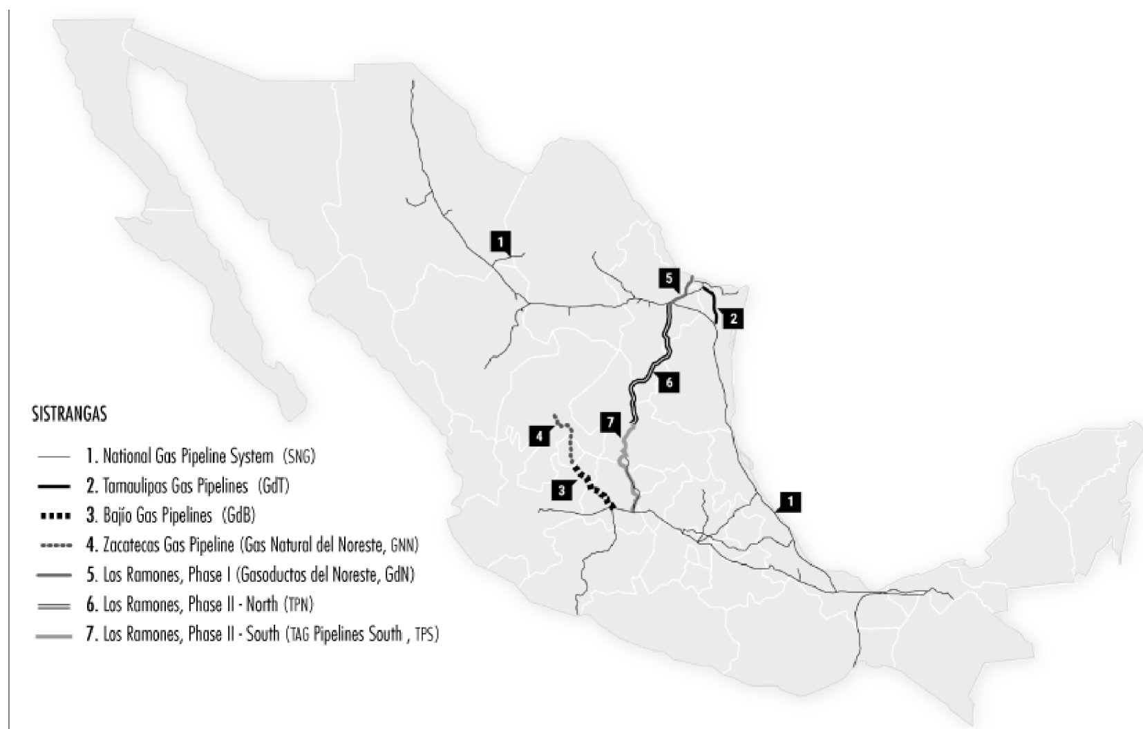
Figure 1. SISTRANGAS configuration