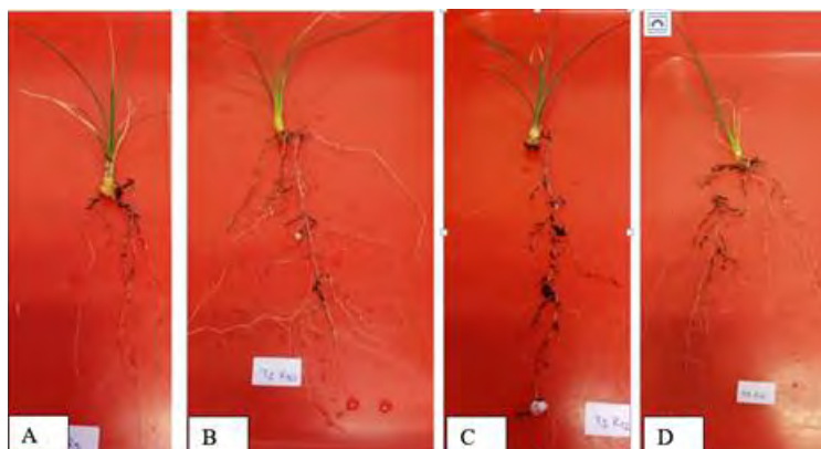
Figure 2. Ex-vitro rooting treatments, 80 days after establishment. A) 1 000 mg kg -1 ; B) 2 000 mg kg -1 ; C) 4 000 mg kg -1 ; and D) 0 mg kg -1 .

In Cattleya trianae , treatment without BAP formed roots in 7.35% (Gil et al. , 2019). On the other hand, Puente-Garza et al. (2015) established the shoots obtained in multiplication in MS medium without regulators, and at 30 days, they generated roots in Agave salmiana , which allowed their successful acclimatization. Zhang et al. (2013) employed regulator-free MS medium in Agave hybrid shoots, regenerated by organogenesis, these generated an average number of 5.39 roots per shoot with a length of 8.44 cm per root within 30 days.