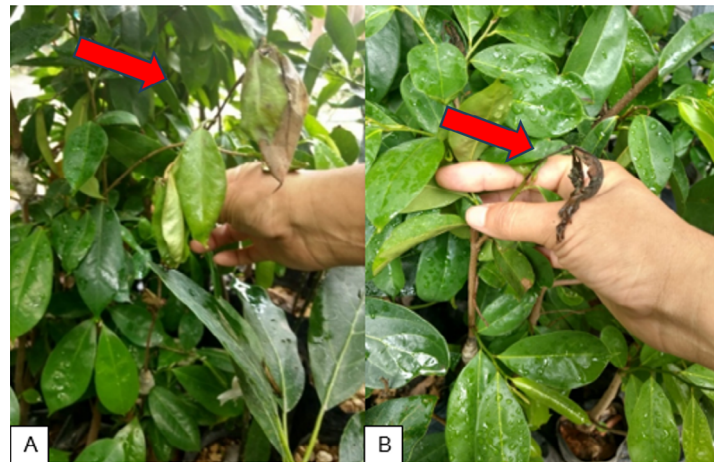
Figure 1. Appearance of branch death in soursop plants 22 days after inoculation with Lasiodiplodia fungus (A). Apex rot in soursop plants 22 days after inoculation with Lasiodiplodia (B).