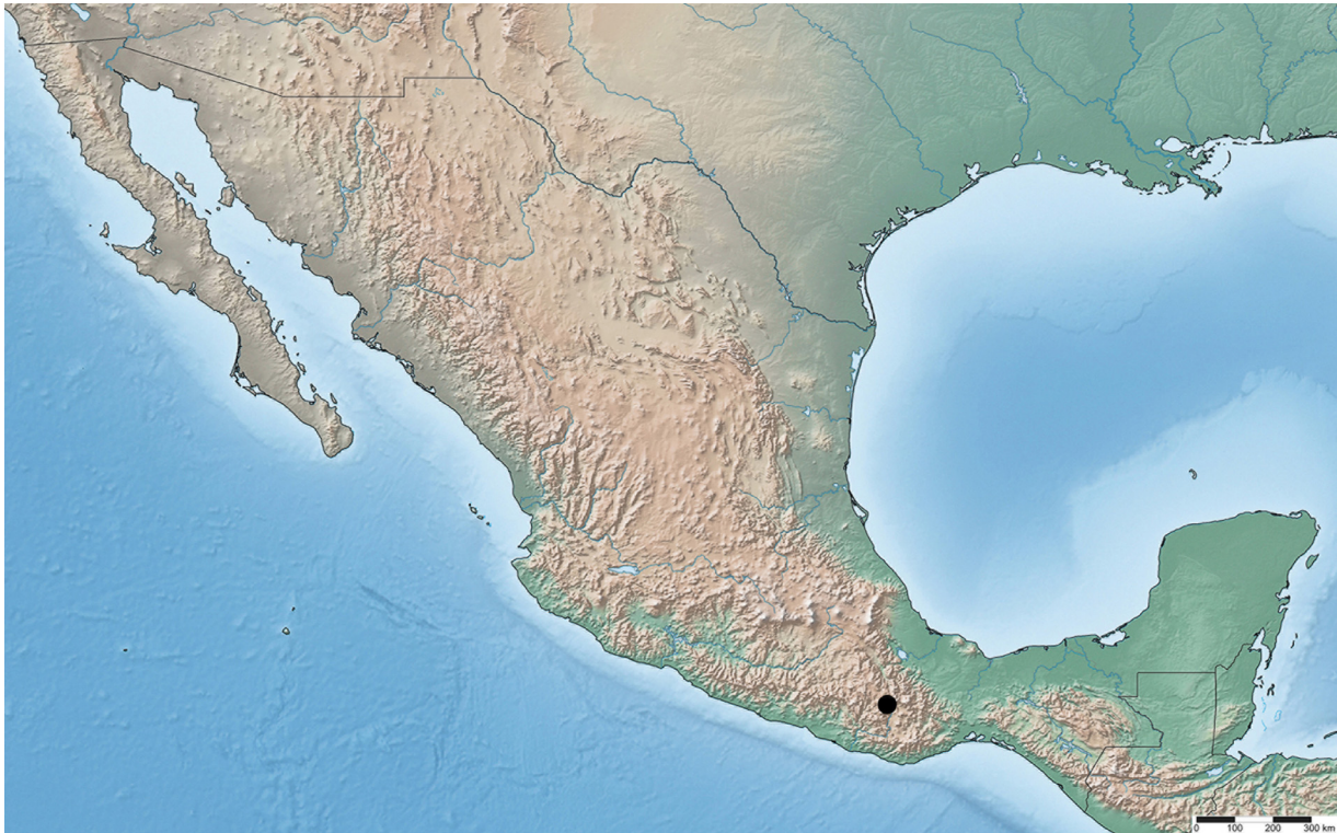
Figure 2. Type locality of Plusiotis cosijoezai sp. n.

its vertex, periocular areas and clypeus are pink whereas in P. cosijoezai they are golden pink, rarely ochre-brown. P. lacordairei 's frontal punctation is dense with large, deep punctures, and its pygidial surface is imbricately rugopunctate (frontal surface almost smooth and pygidial surface transversely rugose in P. cosijoezai ). The parameres in P. lacordairei (Fig. 1i, j) are abruptly narrowed, then evenly tapering and deflecting to narrow, indented apex (parameres with sides convex, tapering to indented apex in P. cosijoezai ).