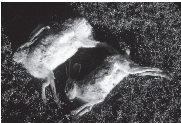
Figure 1. Photo of a pair of Lepus callotis gaillardi killed by a vehicle in New Mexico, USA. The larger specimen is a female.

Using Google Scholar, we reviewed scientific literature about L. callotis , abstracted pertinent information, and plotted collection locales on Google Earth. Collection locations for 281 specimens of L. callotis were obtained from databases in the Mammal Networked Information System (MaNIS; http://www.manisnet.org ) and the