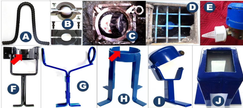
Figure 5. Preventive devices: A) "Gauss" anchor; B) seals for the locknut; C) coating with cement; D) grids in the meter box; E) anti-wire cone; F) "Copa" anchor; G) anchor "Argolla"; H) anchor "Pulpo"; I) Anchor "Casco"; J) anchorage "Seguridad Total".

Based on the aforementioned vulnerabilities, the preventive security devices identified are: