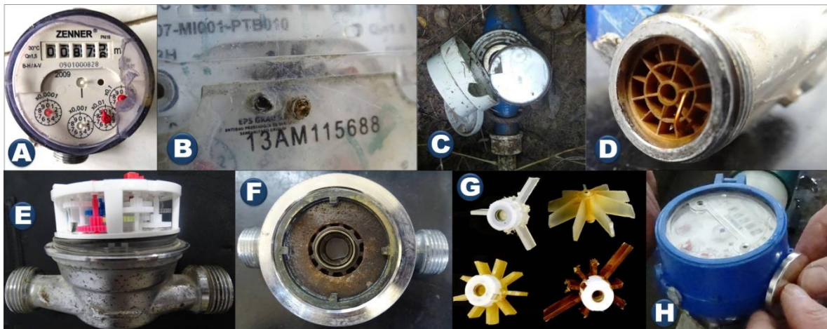
Figure 1. Ways of tampering: A) Vandalized glass; B) perforated glass; C) separate register; D) helices stopped with a wire; E) gear teeth removed; F) magnetic transmission braked with a token; G) cut propellers; H) stopping with a magnet.

of tampering is according to their visibility, the first group being the one where the tampering is evident to the naked eye, the second group that can be noticed only with a careful review of the meter and the third group that does not leave visible evidence. Some frequent forms are shown in Figure 1.