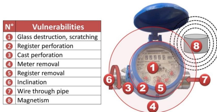
Figure 2. Vulnerabilities of velocity meters.

The eight vulnerabilities identified are shown in Figure 2.