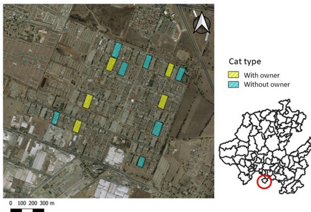
Figure 1. Location of positive cats for Toxoplasma gondii at the CAIT, Hidalgo, Mexico.